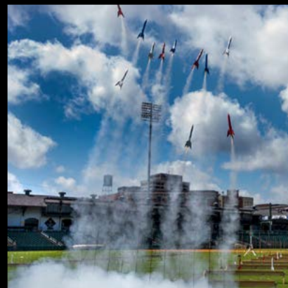
Red, white and blue rockets are launched, at Riverwalk Stadium in Montgomery, Ala., as JROTC students commemorate the 50th anniversary of the Apollo 11 moon landing on Tuesday July 16, 2019.