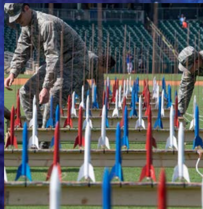
Rockets are prepared for launch.