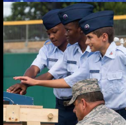
Rockets are launched.