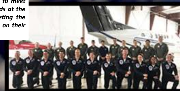
Flight Academy Cadets attending the University of North Dakota got the opportunity to meet the members of the USAF Thunderbirds at the Fargo Air Show. In addition to meeting the Thunderbirds, the cadets got to sit in on their pre-show brief.

already, find an opportunity to lead. It doesn't have to be in Air Force Junior ROTC and in fact helps to have additional leadership outside of your unit. Participate in your unit's aviation related LDRs, multi-copter, rockets, etc.... Participate in the CAP orientation flight program. All of the scholarship recipients were well-rounded individuals who have a desire to explore aviation. This year's selectees will be the same. We're calling on all cadets who have at least a 3.0 GPA, are current enrolled in Air Force Junior ROTC as a sophomore, junior, or senior year for 2019-2020 school year, and have an interest in aviation to apply to this year's Chief of Staff of the Air Force Private Pilot Scholarship. See your instructors for additional information.